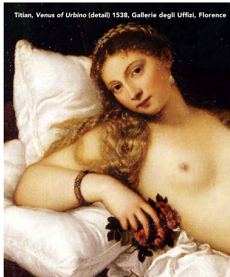
Titian, Venus of Urbino (detail) 1538, Gallerie degli Uffizi, Florence

One of the oldest art museums in the Western world, the Gallerie degli Uffizi lives in the 16th-century Renaissance palace commissioned by the Medici to house their dazzling art collections. Take close looks at masterpieces including Leonardo's Annunciation , Michelangelo's fascinating Tondo Doni , and Titian's alluring painting Venus of Urbino . In the afternoon, enjoy a specially arranged visit to one of Italy's primary restoration laboratories, where you will meet some of the world's most experienced conservational experts and discover a few masterpieces under restoration (pending confirmation). B,L,D