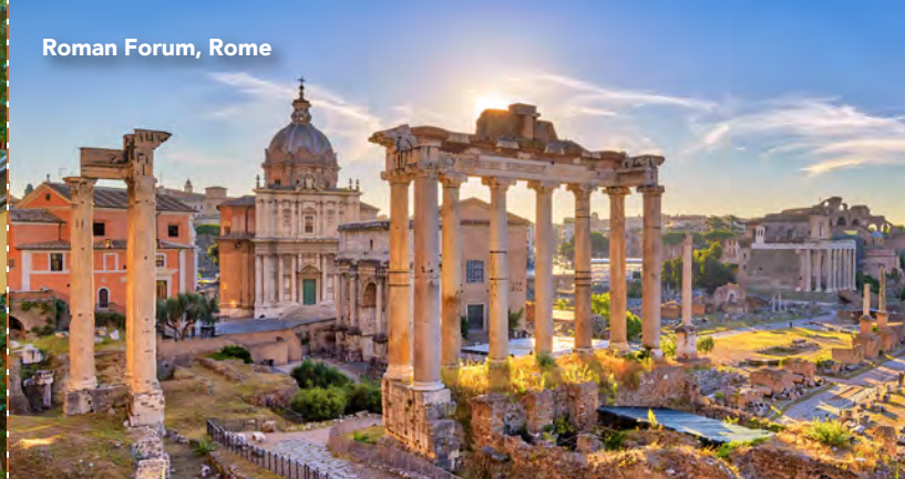
Roman Forum, Rome