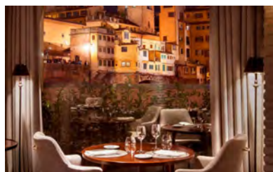
Photos clockwise from top right: Gallery Hotel, Florence; Sina Bernini Bristol, Rome; and Sina de la Ville, Milan