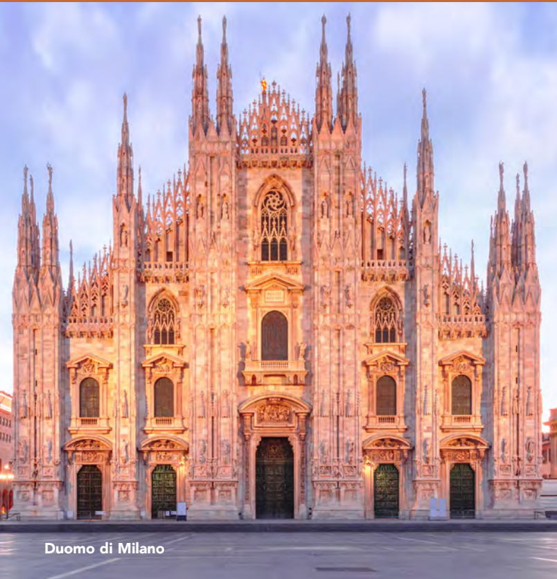
Duomo di Milano