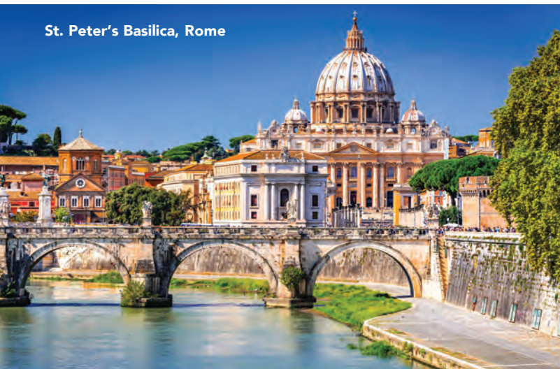
St. Peter's Basilica, Rome

Discover the Museo Stibbert, the Arlington Museum of Art's exhibition partner for A Knight's Tale in Winter 2023. Housed in a 19th-century villa surrounded by an enchanted garden teeming with fountains, statues, and temples in the romantic style and sprinkled with esoteric references, the museum features the stunning private collection of the Italo-British gentlemen Frederick Stibbert (1830–1906). Peruse the displays of ancient weapons as well as objects of art and everyday life of the European, Islamic and Far Eastern civilizations, with a particular focus on Japanese items. After lunch, transfer by train to Rome, where the remainder of the day will be at leisure. B,L